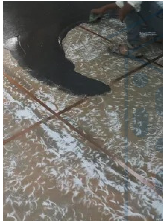
ESD / Anti-Static Flooring

Prevents electrostatic discharge. Used in electronics, data centers, and clean rooms.